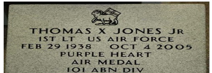
SMALL FLAT GRANITE (L)

This grave marker is 18 inches long, 12 inches wide, and 3 inches thick. Weight is approximately 70 pounds. Variations may occur in stone color.