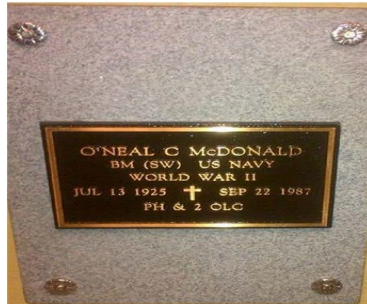
BRONZE NICHE (Z)

This niche marker is 8-1/2 inches long, 5-1/2 inches wide, with 7/16 inch rise. Weight is approximately 3 pounds; mounting bolts and washers are furnished with the marker. Used for columbarium or mausoleum interment. Also provided to supplement a privately-purchased headstone or marker for eligible Veterans who died on or after November 1, 1990 and are buried in a private cemetery.